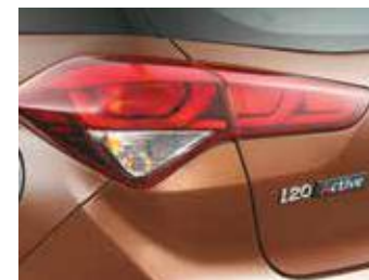
Unique Designed Tail Lamps