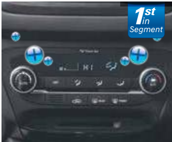
FATC with Cluster Ioniser