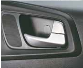
Impact Sensing Door Unlock & Speed Sensing Auto Door Lock