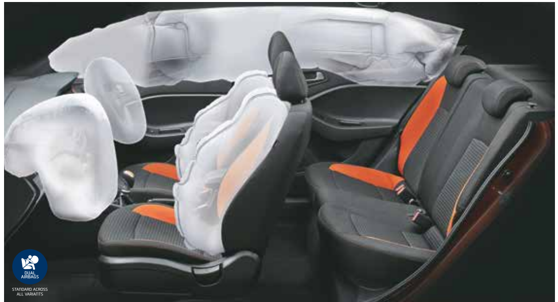
Six Airbags (Front, Side & Curtain)

The i20 ACTIVE has safety measures that always make you feel at ease. So whether you're chilling with your friends in the car or out on a trip, feel safe and enjoy the drive.