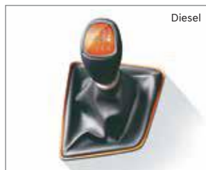
6-speed Manual Transmission