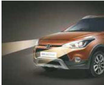
Headlamp Escort Function