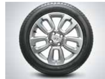
R16 Diamond Cut Alloy Wheels