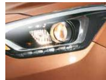
Projector Headlamps with LED DRL, Positioning and Cornering Lamps