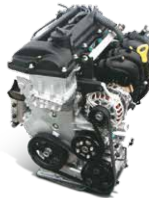
1.2L Kappa Dual VTVT Petrol Engine