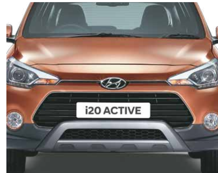
Front Air Dam with Two Tone Bumper and Silver Finish Skid Plates