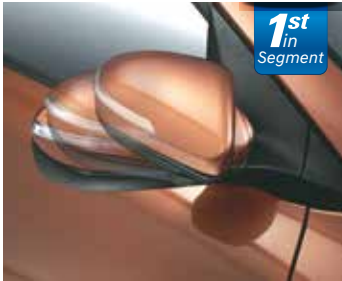
Auto-foldable Electric Mirrors with Welcome Function