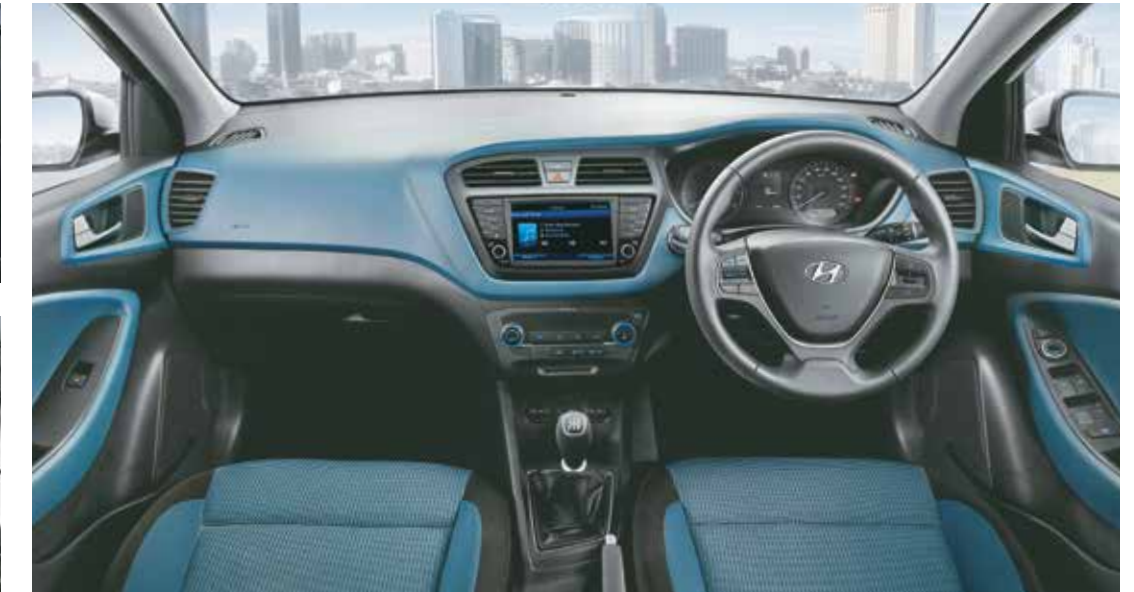
Two Tone Interior Key Colour

The spunky and stylish i20 ACTIVE is thoughtfully designed with vibrant interiors (with the options of Tangerine Orange and Aqua Blue) and ample space. The 1st in segment 17.77 cm Audio Video Navigation System comes with smartphone connectivity (Apple CarPlay, Android Auto and MirrorLink).