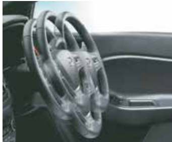
Tilt and Telescopic Steering