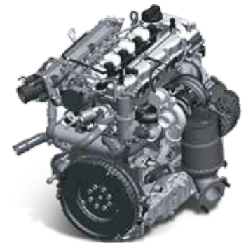
1.4L 2nd Gen U2 CRDi Diesel Engine