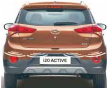
Reverse Parking Sensors with Camera