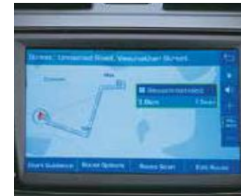
3D Map View