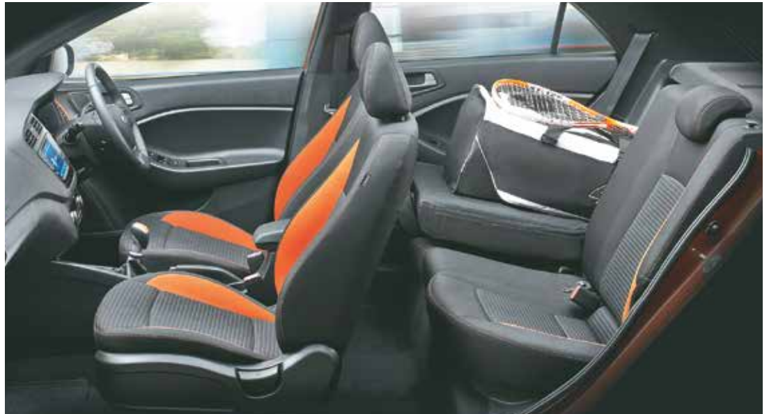
60:40 Split Rear Seat

Comfort is what makes every drive a pleasure. That's why, every inch of the i20 ACTIVE spells comfort and convenience. There are many features and specifications that are exclusively designed for those who like to do things effortlessly.